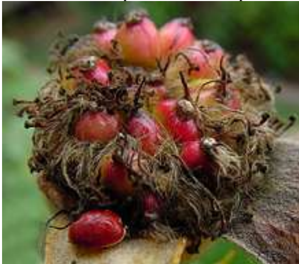
Hip with exogenous seeds

Hips can fail for many reasons. Fertilizing the seed parent can cause hips to fall off. Squirrels, birds, rodents, and all sorts of varmints love to eat them. One of the parents might be sterile or might not be a match due to chromosome count or “ploidy”. Ploidy is the number of homologous chromosome sets present in a cell. Modern roses are mostly “tetraploids” which have 28 chromosomes. Many older roses are diploids and have 14 chromosomes or triploids with 21. Frequently, attempts to cross roses with different ploidies result in hips that fail.