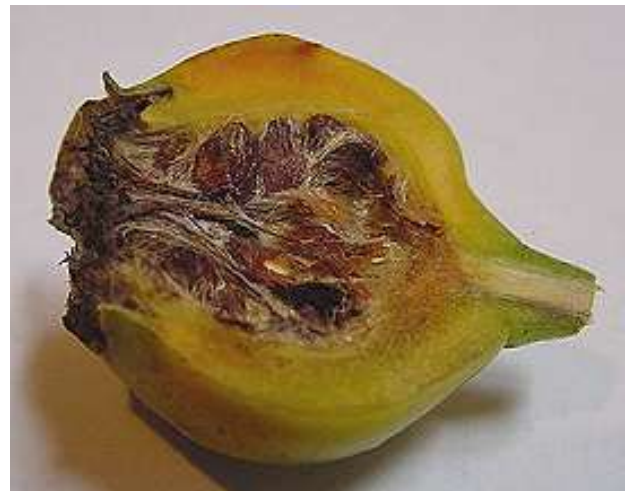
Hip with dead seeds inside

If moisture gets inside the hip, as in the photo above, the seeds may all turn brown and die. The most important thing to remember is to harvest the hips before they get mushy as once that happens the seeds inside most certainly will have died. Also, be sure to pick all hips before the first frost.